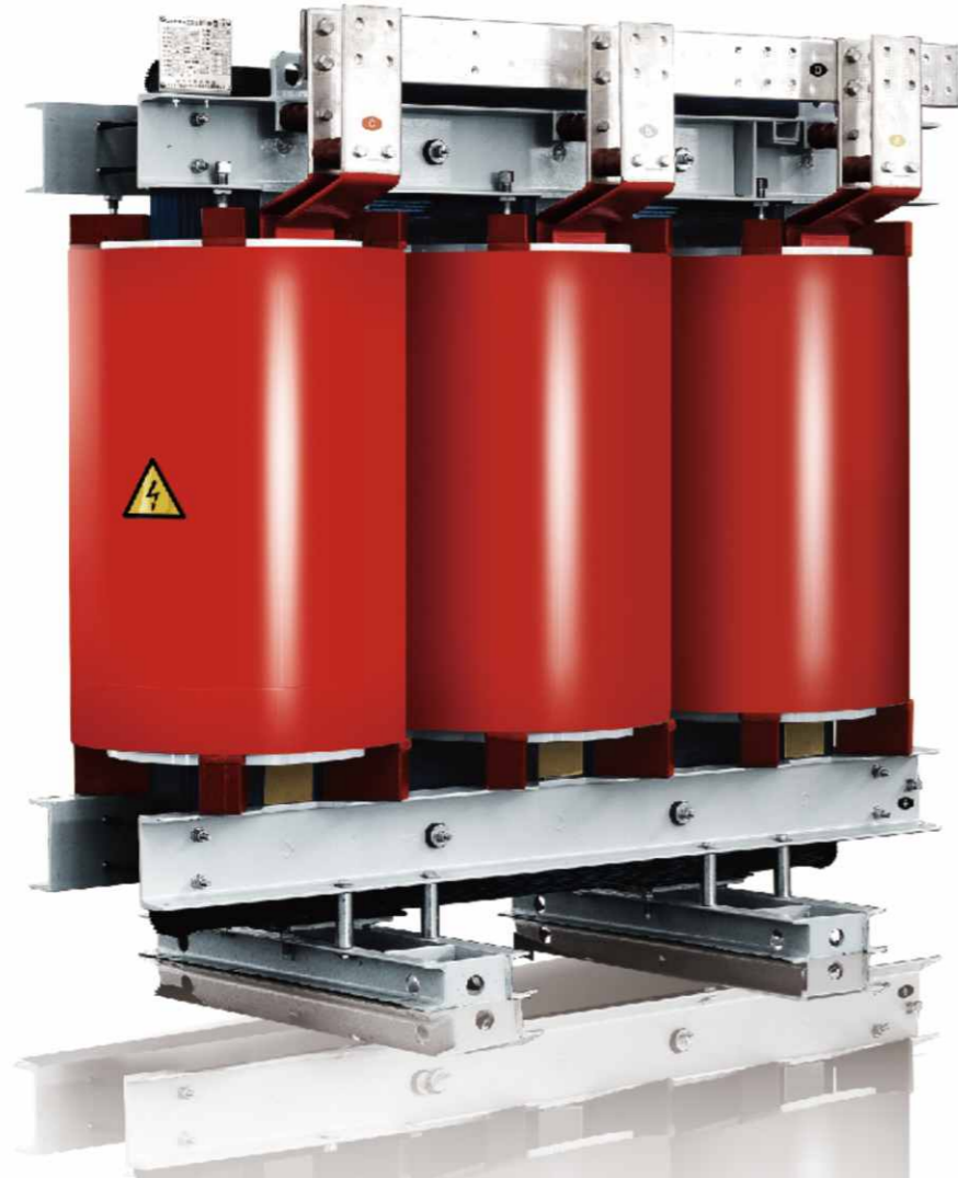
干式变压器 DRY-TYPE TRANSFORMER